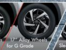
17" Alloy Wheels for G Grade