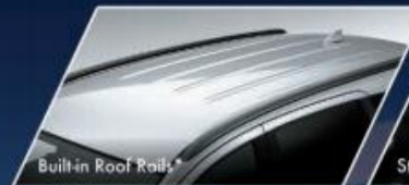
Built-in Roof Rails*

RUSH INTO ACTION WITH A RIDE DESIGNED FOR EXCITEMENT, INSIDE AND OUT.