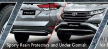
Sporty Resin Protectors and Under Garnish