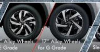
16" Alloy Wheels for E Grade