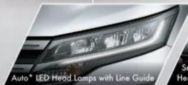
Auto* LED Head Lamps with Line Guide