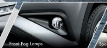
Front Fog Lamps