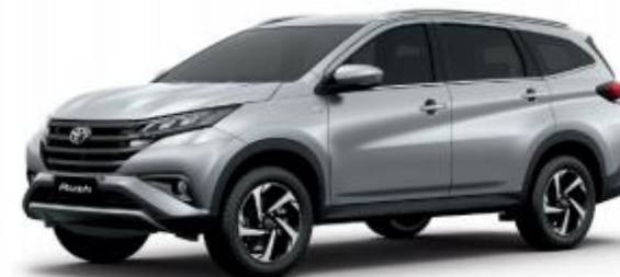
SILVER MICA METALLIC