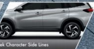
Sleek Character Side Lines