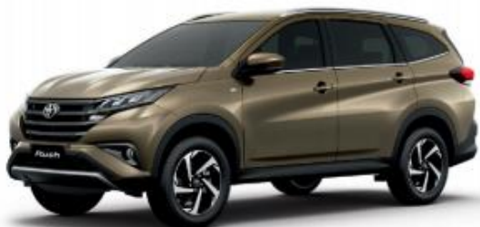
BRONZE MICA METALLIC