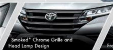
Smoked* Chrome Grille and Head Lamp Design