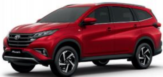
DARK RED MICA METALLIC